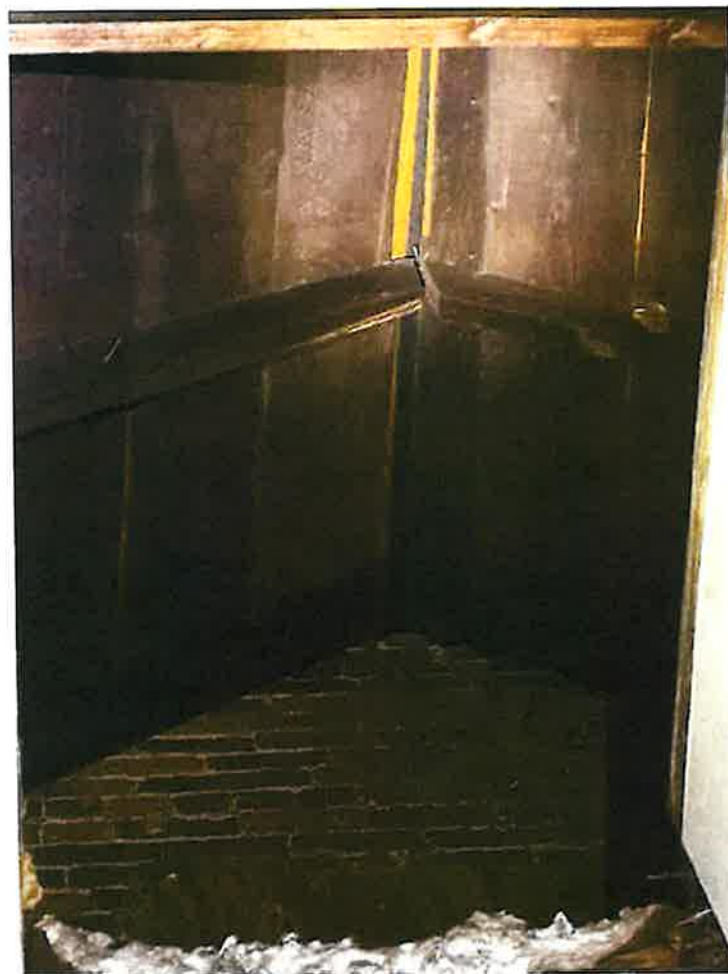
Separation of Roof Rafters