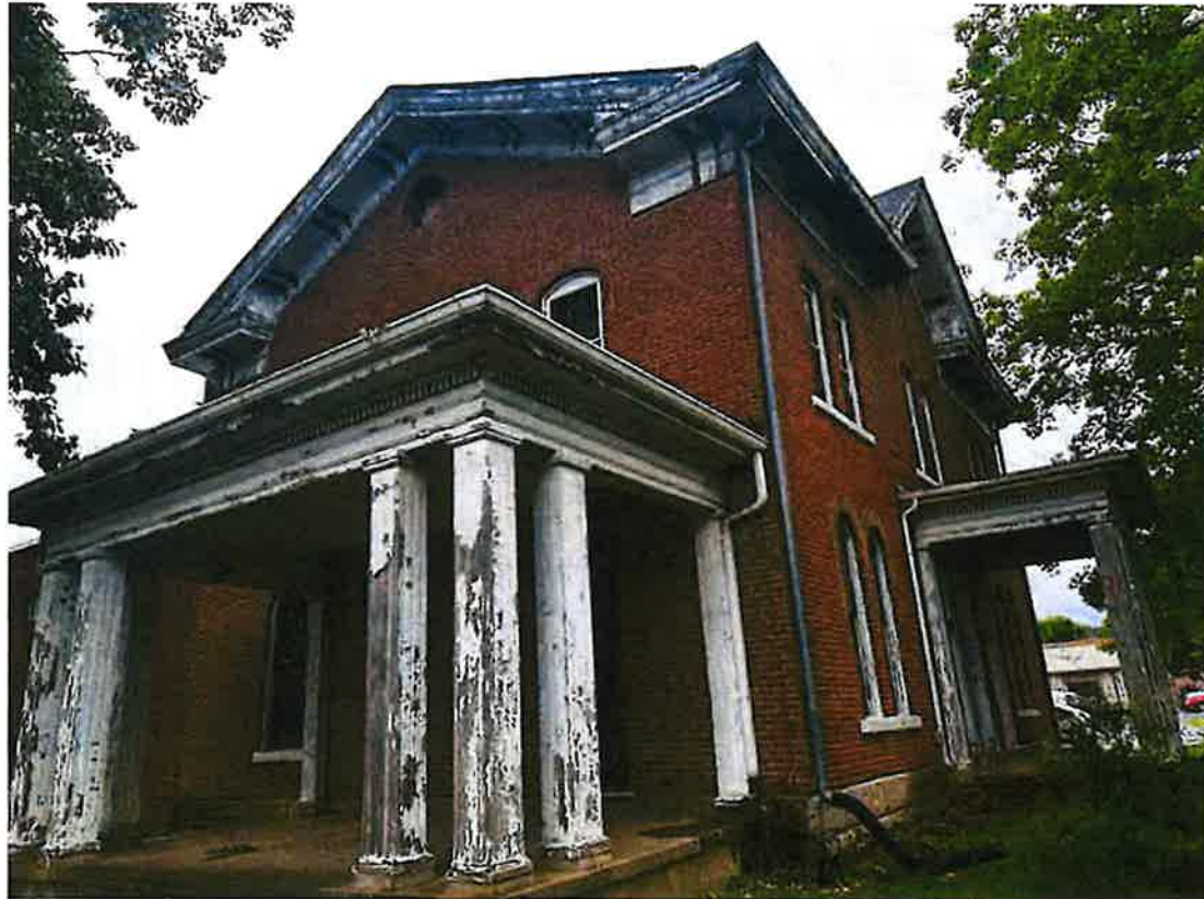
Main Building Exterior – West and South Sides