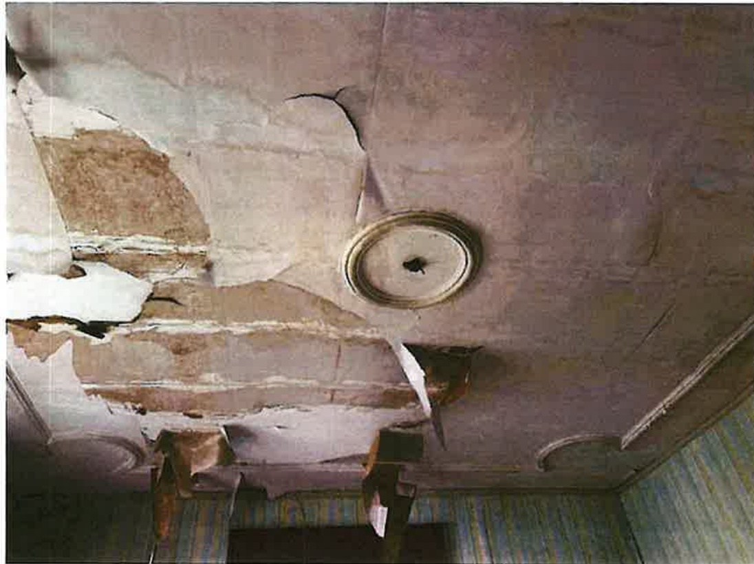
Degraded Paint and Ceiling