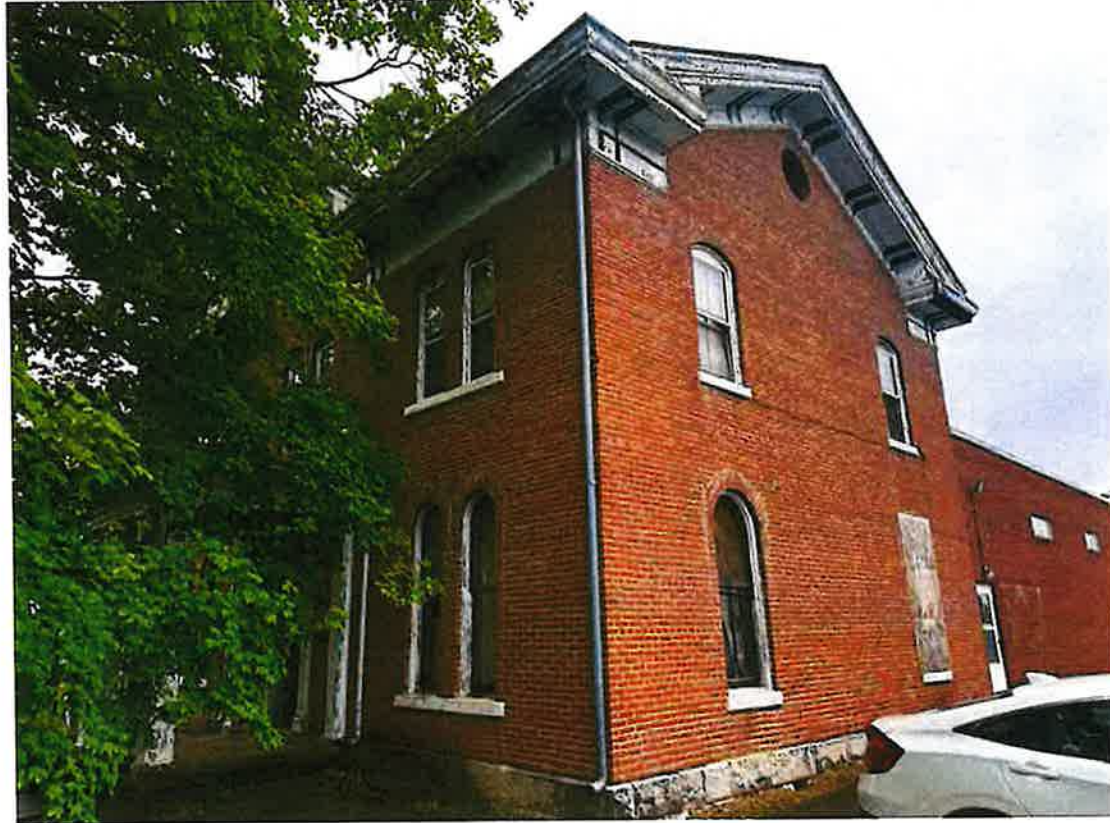
Main Building Exterior – South and East Sides